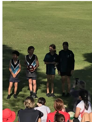
Collecting the Champions trophies

We had four teams representing the school. AFL Football, Netball A, Netball B and Soccer. Congratulations must go out to the AFL and Netball A teams who displayed outstanding skills and teamwork to finish the day as Champion in their divisions. The Netball B and Soccer teams also dug deep and put in exceptional efforts to finish runner up in their divisions. If the standard of sportsmanship, endeavour and behaviour that all our students displayed on the day is any indication then I can safely say that the future sporting successes of Cloverdale Primary is in safe hands.