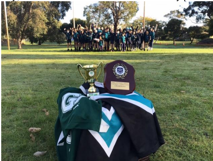
2020 Inter-School Winter Sports Team

On Tuesday, 50 students from year 4 to 6 headed off to Kewdale Primary School to represent our school and compete in the 2022 Inter school Winter Sports Carnival. The students who were selected in their respective teams had shown throughout the term that they had the determination and willingness to stand out from the crowd to be selected in the team by their coaches. Selection in any inter-school team is a fantastic individual result, so no matter what the results were on the day, all the students should be immensely proud of their efforts.