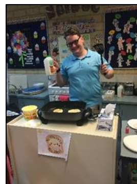
Pancakes in Breakfast Club