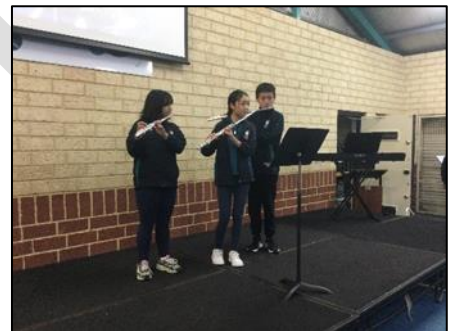
Our Flute students delighting the crowds