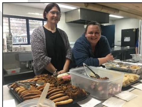
Yummy Canteen Food