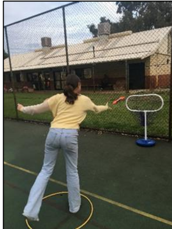
Phys. Ed activity