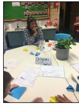
Making Origami with Sensei