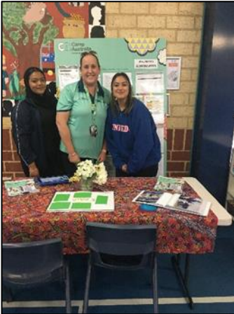
The Ladies of Camp Australia